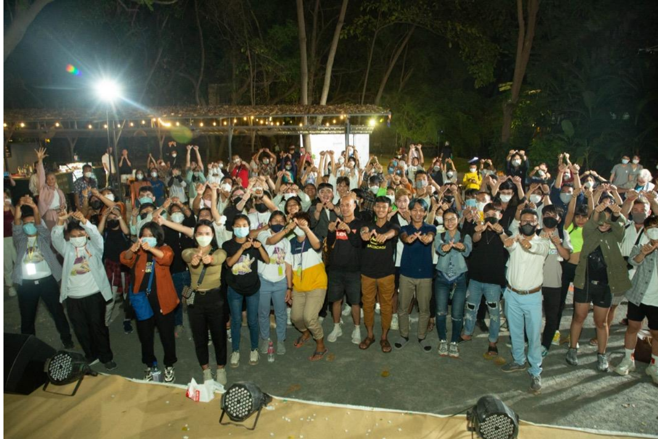
11 th December 2021 at Odom Garden: Cultural Art Performance and Exhibition Event Limit public participation: 250 people