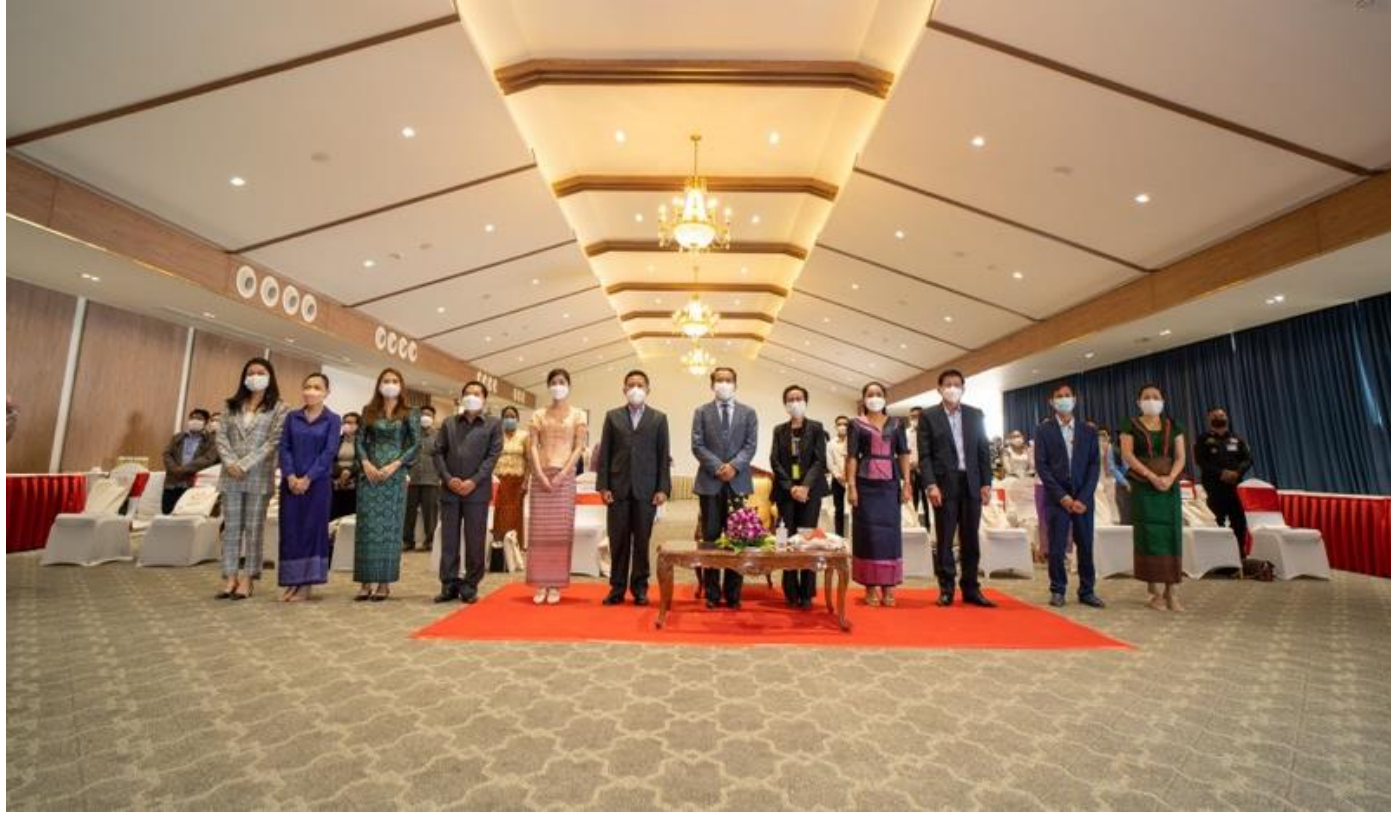
9th December 2021 at Himawari Hotel: Roundtable Dialogue on Advancing Legal Protection for LGBT+ Couples in Cambodia under the presiding of H.E. Mr. Keo Remy, Minister Delegate Attached to the Prime Minister and President of the Cambodian Human Rights Committee Total Participants: 85 people