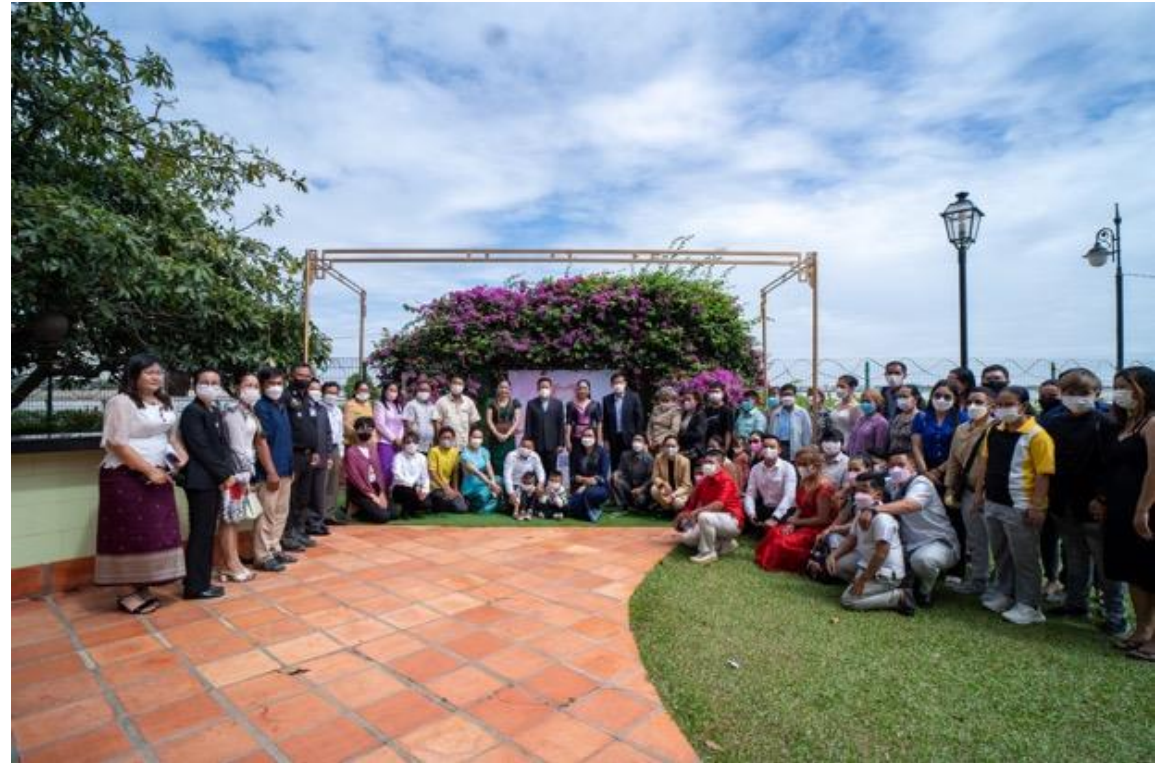
Photo: The launching of ខ្ញុំទទួលយក - I Accept Campaign on 9th December 2021

Local authorities national government representatives support the launch of “ខ្ញុំទទួលយក - I Accept” campaign, one of the important strategy for public awareness raising for accepting LGBT+ persons and their legal marriage.